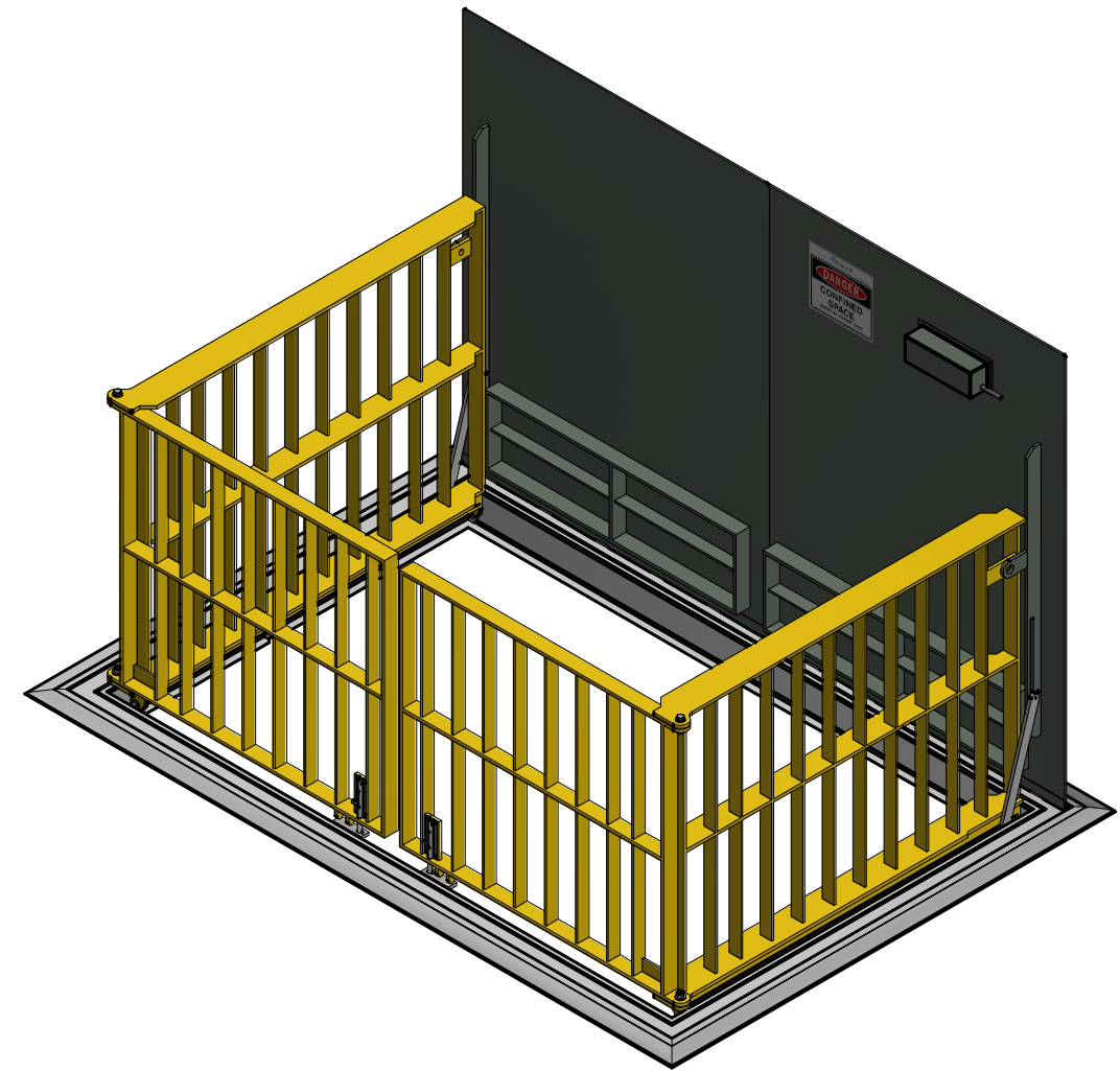
ISOMETRIC SCALE 1/20